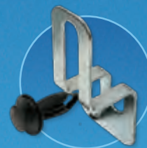
Security Plate Option