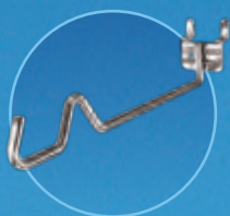
Anti-Sweep™ Display Hook