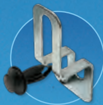
Security Plate Option