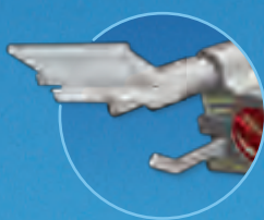
FlipScan® Label Holder Option