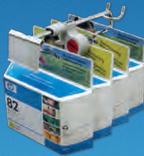
Lock all or some items