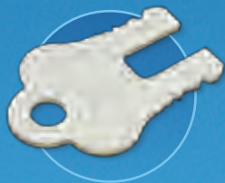
Keyed Locking System